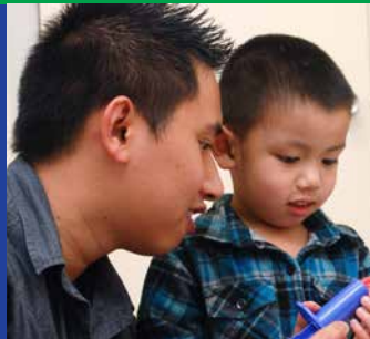
More Than Words®