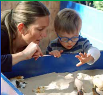
It Takes Two To Talk®